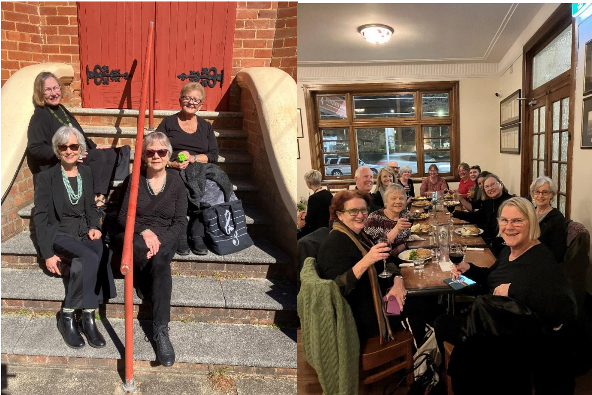
Jubilate Singers waiting to perform and then celebrating together

In August 2023 we were well received singing madrigals at the Blackheath Choir Festival. This was a great weekend for the choir to relax together, as most of us stayed in the mountains and were blessed with cool but sunny days.