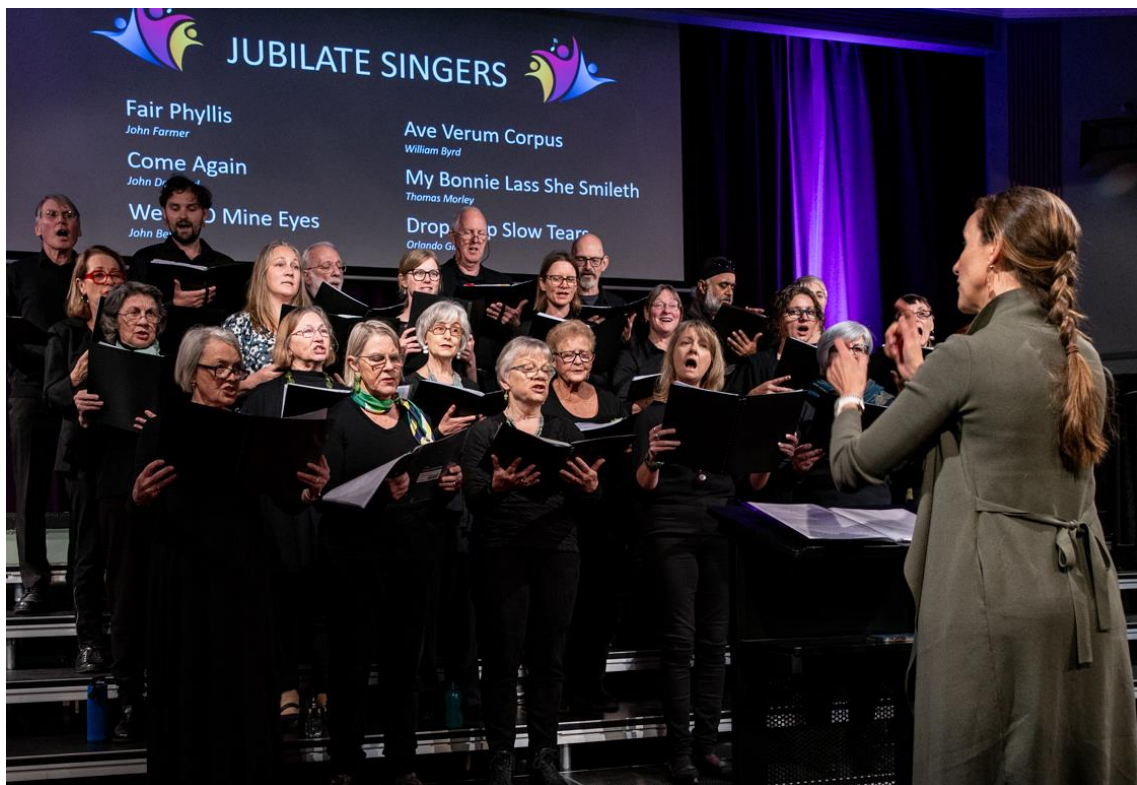
Our new repertoire of Elizabethan madrigals