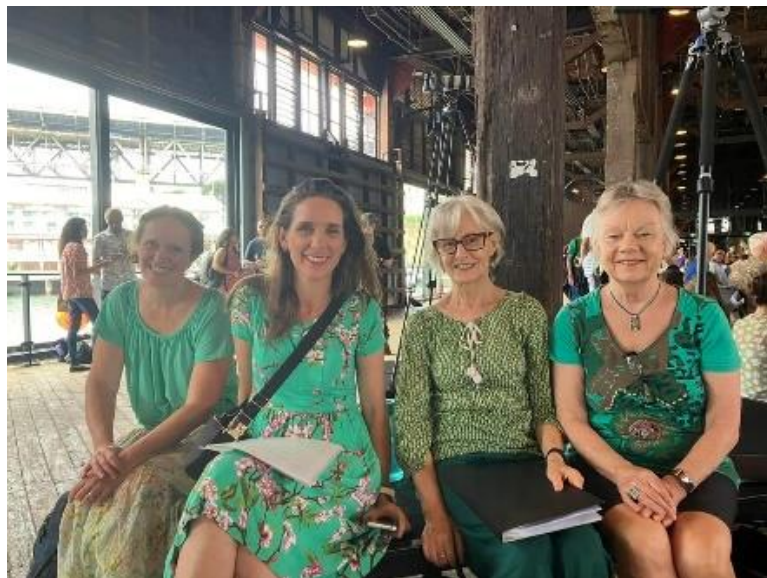
Waiting for the mass performance at Walsh Bay.

December came around quickly and a small group of us dressed in green to join with other choirs to record, For All Earth kind , which was to be played at the international climate conference. It is certainly a unique experience singing in large group performances and we always enjoy being part of these.