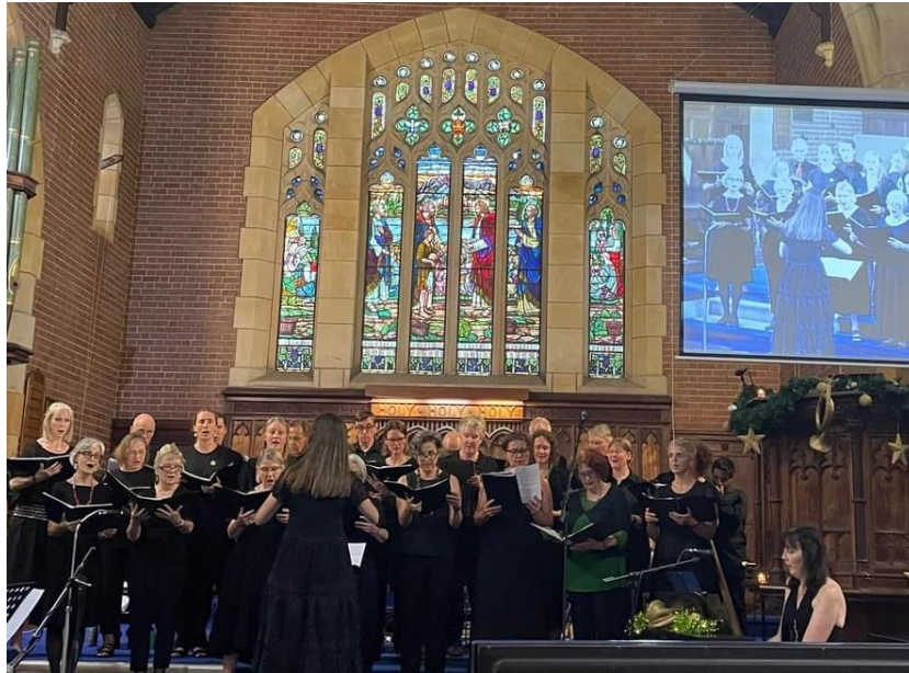
A joyful community Christmas celebration at Holy Trinity